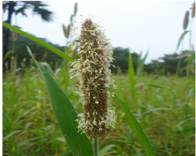
Figure 2: Pearl millet ( bajra )

This paper reports the findings from a short study of millet production in the Anantapur District of Andhra Pradesh, India. Anantapur is a very dry district which receives less than 600mm of rain on average, with a high degree of variability. It also has a history of production of a variety of millet varieties—especially sorghum, finger millet, pearl millet, and foxtail millet. It is also the site of extensive efforts by a variety of NGOs to promote millets in recent years. In October of 2015, we led a team of field assistants to conduct surveys and qualitative fieldwork on millet production within five panchayats (local village units) spread across three mandals (secondary-administrative units) of the district. Study sites were selected to vary according to socio-economic conditions, the distance from the nearest market center, and whether an NGO is active in the village. During the study, our team undertook detailed discussions with residents in the study villages about changes in agricultural production strategies over the past ten years, perceived risks associated with different crops, and changes in millet consumption patterns. Although the sample is small, our data nevertheless reflect some of the diversity of current millet production trends in the area.