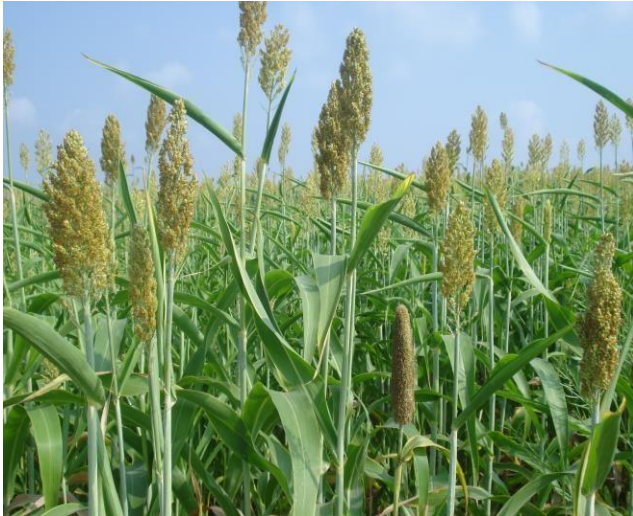
Figure 1: Field of sorghum ( jowar )